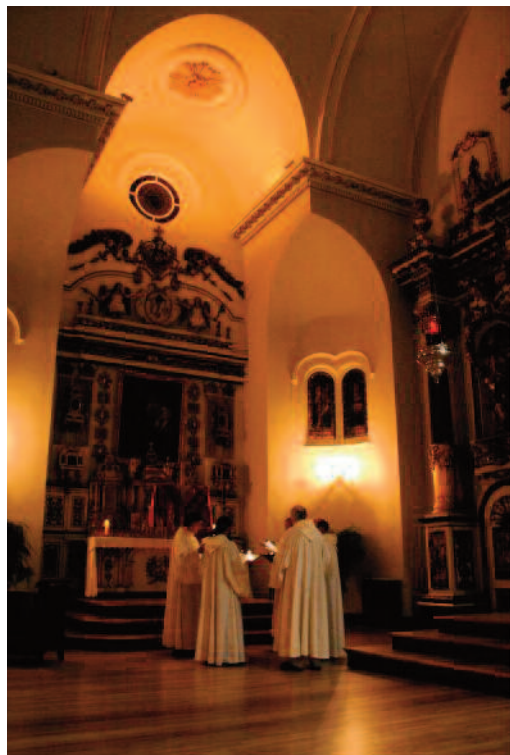
Schola Saint Grégoire in concert at the Chapel of the Ursulines of Quebec City (2006).

Schola Saint Grégoire of Montreal, 4601, rue Jeanne-Mance, Montreal, QC H2V 4J5 scholagreg@sympatico.ca • www.scholagreg.org