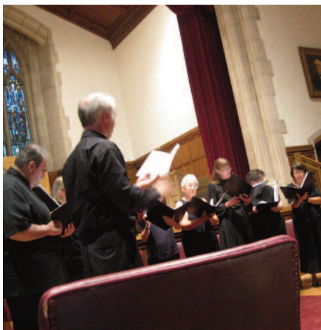
Opening concert with Hamilton Schola Cantorum.

Other memorable events during this extraordinary weekend were the Saturday banquet, which provided an ideal occasion for socializing and enjoying a huge meal, and Sunday mass, which was sung in Hamilton's majestic Christ the King Cathedral. Once the mass had ended, it was finally time to say goodbye, but not without one last group picture on the steps of the cathedral.