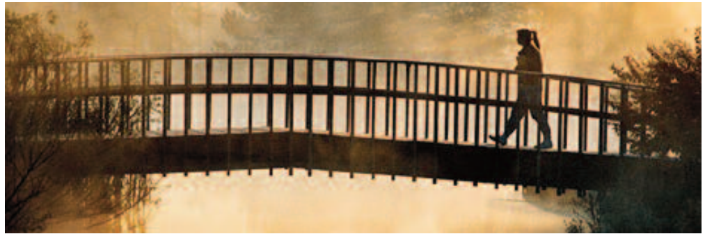
Pedestrian bridge across Glodsworth Pond, Western Michigan University, Kalamazoo

The sessions are The Liturgical Office of Saint Thomas Becket: Current Research Projects, and The Liturgical Office of Saint Thomas Becket: Chant Selections (A Performance). The Congress is an annual gathering of over 3,000 scholars interested in Medieval Studies. It features over 600 sessions of papers, panel discussions, round tables, workshops and performances. There are also some 90 business meetings and receptions sponsored by learned societies, associations and institutions. The exhibits hall boasts nearly 70 exhibitors, including publishers, used book dealers and purveyors of medieval sundries.