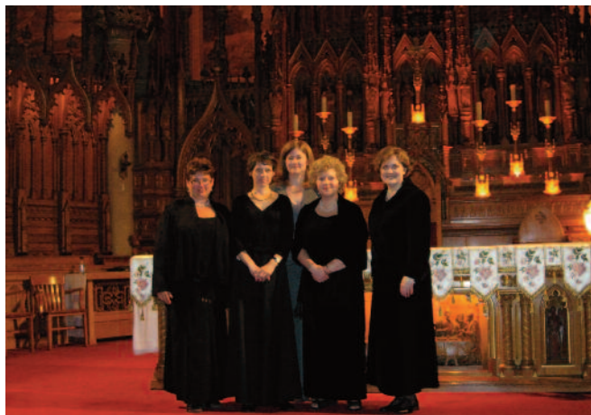
Above: Schola Magdalena performed in May at the beautiful St-Viateur-d'Outremont Church in Montreal. Right: Participants in the Second Annual "Journées grégoriennes de Montréal" sang mass from the gallery at St-Viateur on Sunday, May 10, 2009.