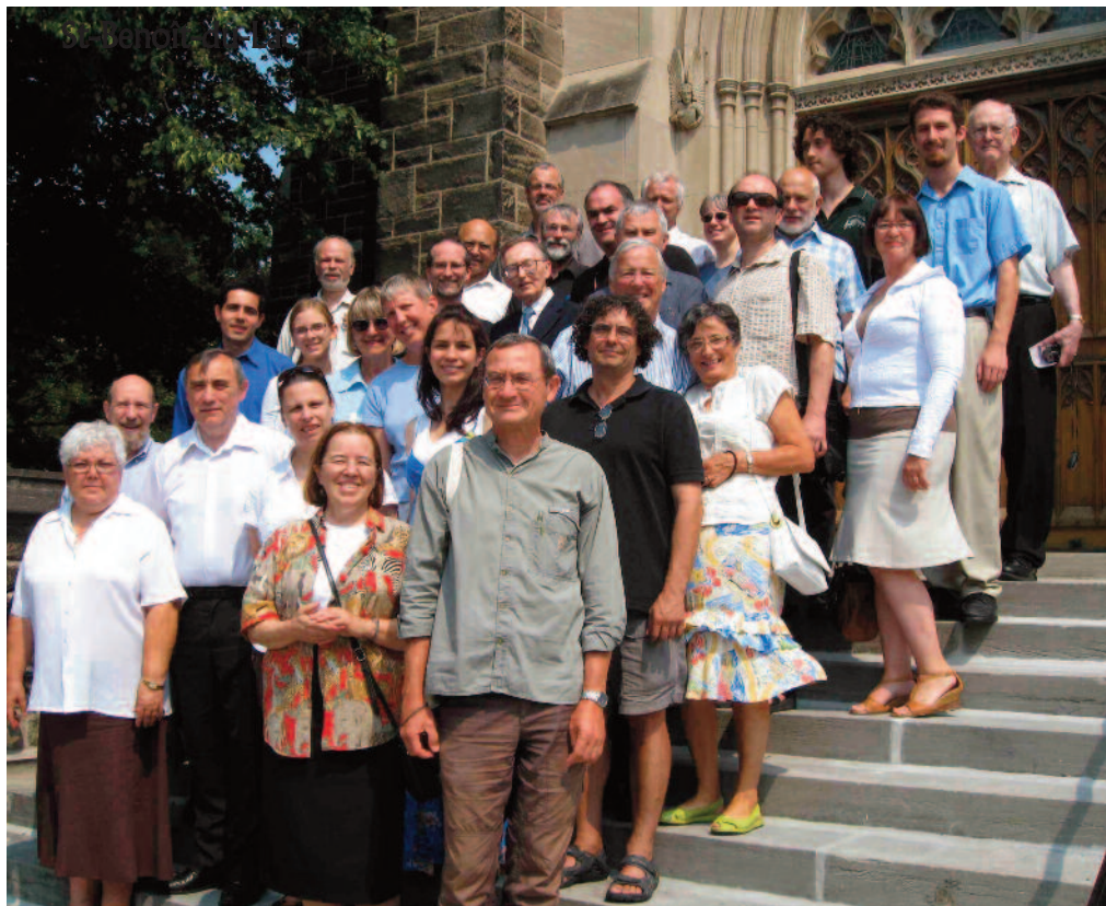
Fourth Annual Colloquium participants in front of Christ The King Cathedral of Hamilton.

The Gregorian Institute of Canada (GIC) undertakes research and education to promote the study and performance of Gregorian and other Western chant repertoire in Canada. GIC is a not-for-profit corporation, licensed and authorized to provide official tax receipts for donations in support of its mission. Founded in 2004, GIC is a non-denominational association. GIC is affiliated with the School of the Arts, McMaster University, Hamilton, Ontario.