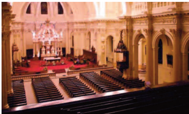
Saint-François-Xavier Cathedral, Chicoutimi