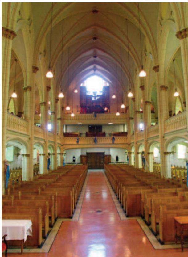
Sacré-Coeur Church, Chicoutimi