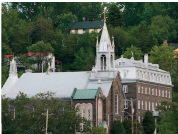
Servantes du Très Saint-Sacrement Monastery, Chicoutimi